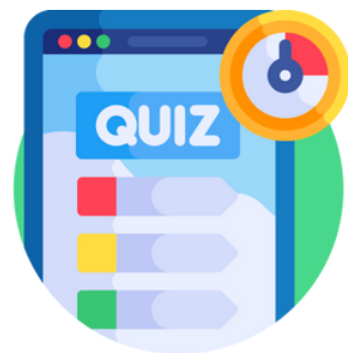
Online Exams & Result