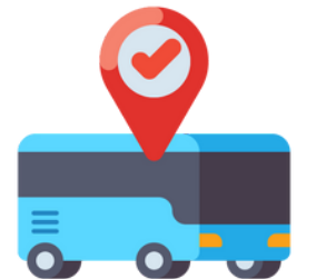
Transport/ Bus Tracking