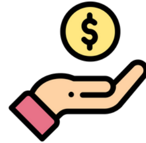
Fees Management & Online Payment