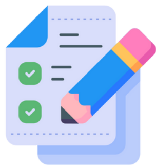
Offline Exams & Result